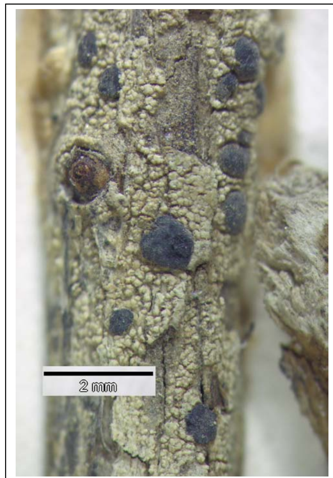
The possibly extinct lichen, Bacidia jacobii . The dark oval shapes are the apothecial discs or permanent fruiting bodies of the lichens.