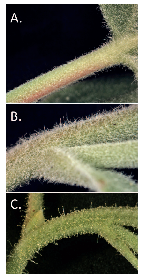
FIG. 3. Differences of stem and rachis pubescence of Arctostaphylos patula subspecies. A) A. patula subsp. gankinii illustrating short canescent hair on leaves, petiole and stem; B) close-up of rachis and bracts on A. patula subsp. gankinii ; C) A. patula subsp. patula rachis and bracts showing the short golden glandular hairs characteristic of the species.

chaparral stands along Tamarack Trail above Upper Sardine Lake near the type locality (39°37'10"N, 120°37'35"W; 1900 m). In eight random samples, the non-glandular morph ranged from 22% to 78% of the stand. Overall, 58% of all 397 individuals sampled in this population were non-glandular.