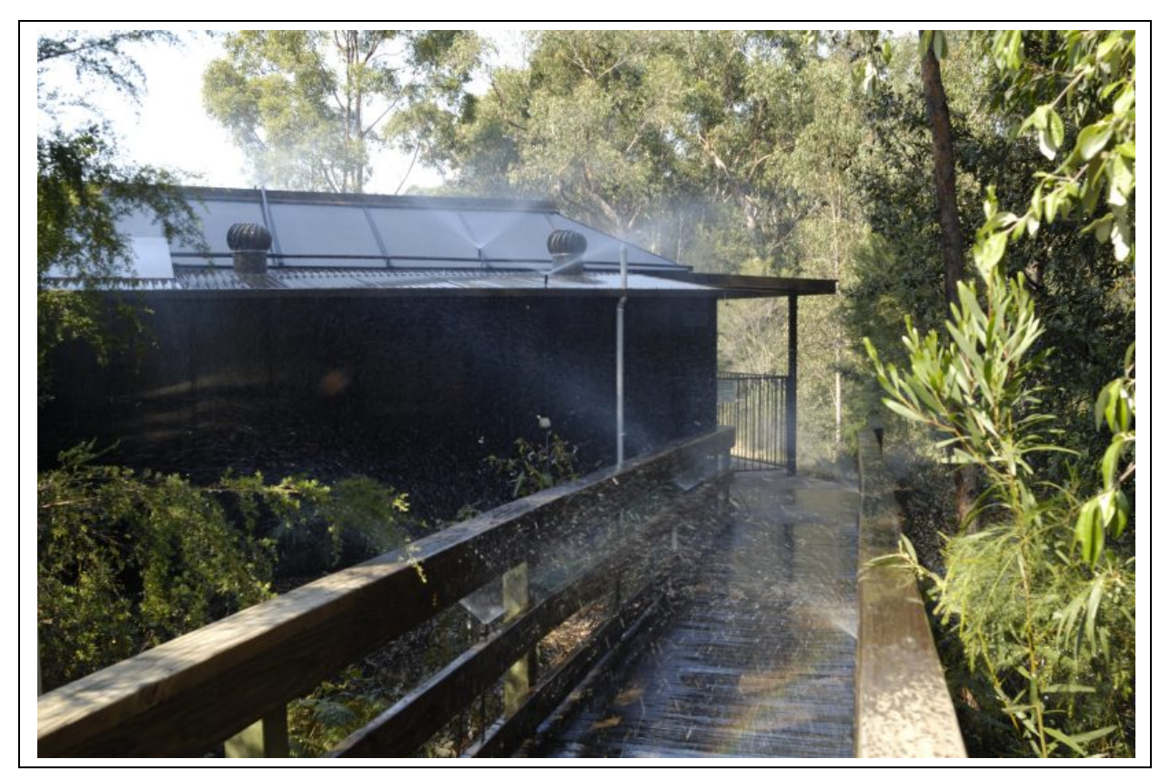
Figure 6. External sprinklers. As a wildfire approaches, external sprinklers wet the structure at risk, the surrounding environment, and increase the local humidity to prevent ignition. Photo: A conference center in New South Wales, Australia.

Many residents have retrofitted their homes with external sprinkler systems to protective effect. For example, under-eave misters on the Conniry/Beasley home played a critical role in allowing the structure to survive the 2003 Cedar Fire in San Diego County. The home was located in a canyon where many homes and lives were lost (Conniry 2008).